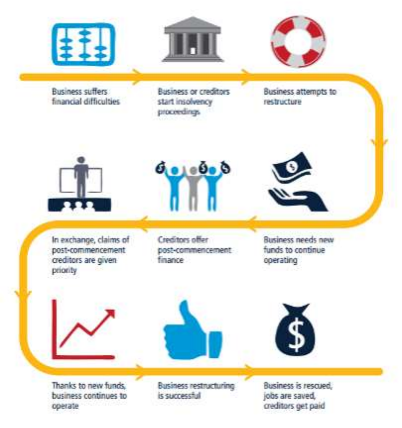
Fig. 1. Post commencement finance can be critical in helping a business go from insolvency to recovery.

Insolvency law can create a predictable and enforceable framework for lending to companies in insolvency proceedings through provisions explicitly allowing post-commencement borrowing and providing some assurance of payment. Without such provisions, lenders are unlikely to make new funds available on acceptable termsor indeed on any terms at all.